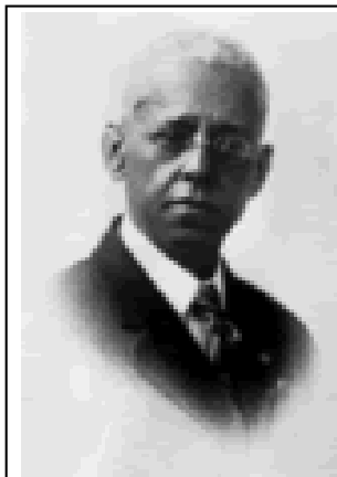
Recognise this man?

He was born in Massachusetts in 1848. His mother and father were escaped slaves from Virginia. When he was a boy his father was arrested and tried as a slave fugitive. The judge ordered his return to Virginia and slavery, but money was raised by the local community to pay for his freedom. However, his father feared his re-enslavement and went underground.