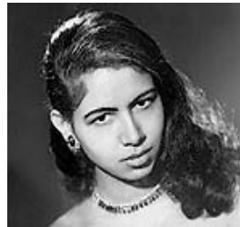
She was a famous concert pianist but do you know who she is? Turn to page 4 to find out more.