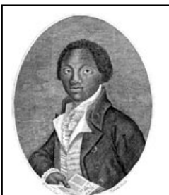
c.1789: Olaudah Equiano

Equiano was an African-born writer whose experiences as a slave prompted him to become involved in the British abolitionist movement.